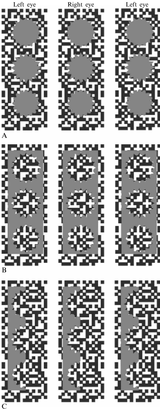
Figure 2. A comparison of figures (A), holes (B), and non-enclosed regions of background (C). The left and right pairs are for divergent and convergent fusers. Ten naive observers looked at the stimuli in A using a stereoviewer: when the two images are fused the grey shapes float over a checkerboard. The observers were asked to use the central shape as a standard and judge whether it was more similar to the one at the top or the one at the bottom (the spatial relationship was reversed for half of the participants). Another group of ten observers saw the stimuli in B which they described as holes, and a third group of ten saw the stimuli in C. A majority chose the top shape (80%, 90%, and 100%, respectively, for stimuli A, B, and C).

and most of them chose the spiky shape as more similar to the standard as predicted by Subirana-Vilanova and Richards; however, observers also chose the spiky shape in the case of background regions (C), suggesting that this phenomenon is not specific to holes.